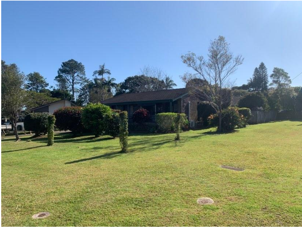
Plate 2 – North facing view