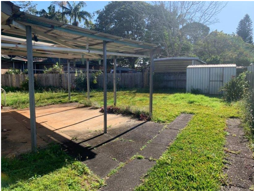
Plate 1 – Northeast facing view

Any trees noted to be within the building zone, should be removed and the excavation remaining should be backfilled with natural material and reinstated in layers to a minimum of 95% Standard Maximum Dry Density.