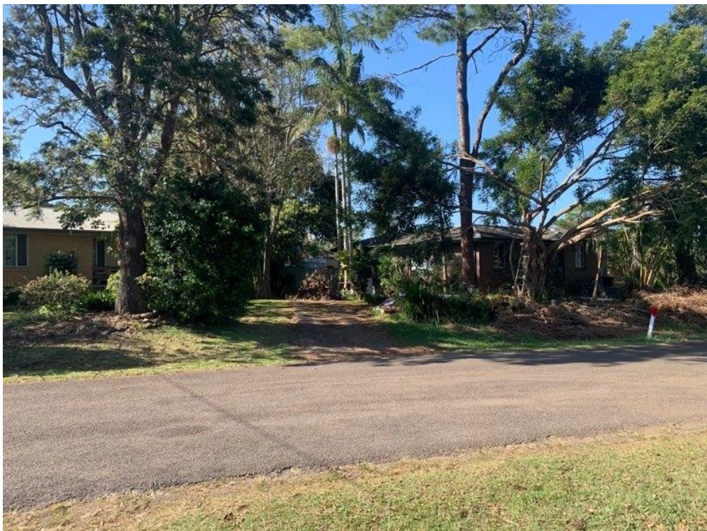
Plate 3 – Southeast facing view